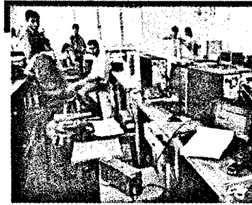
A physics lab at Delhi University.

The nuclear watchdog's nod is meant exclusively for the taught programmes of the department as its students — all 332 of