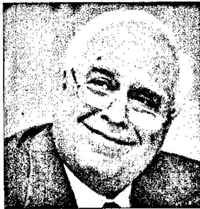
INCLUSIVE POLICY: Kapil Sibal

Unlike the IIMs, the IITs are seen to draw students from across the socio-economic spectrum. Any move to hike fees is seen as adversely impacting this avenue